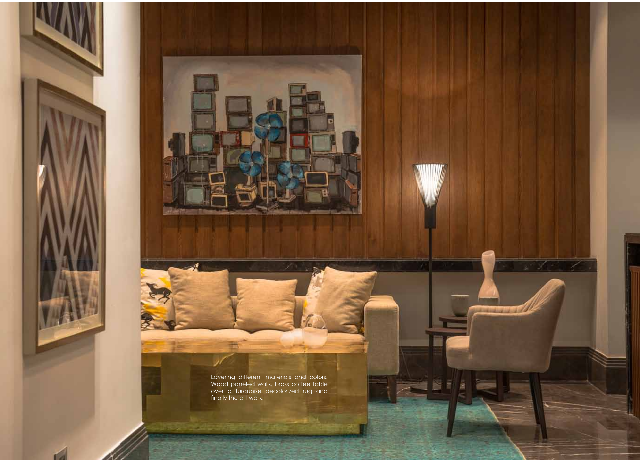
Layering different materials and colors. Wood paneled walls, brass coffee table over a turquoise decolorized rug and finally the art work.

room has at least one window looking outside, including the room designated for a live-in-maid. This is as it should be. The windows are large inviting the outside in. The kitchens are not the open American style, but rather a traditional kitchen that can be closed. This they feel is important because of the Egyptian style of cooking and entertaining. A closed kitchen does not allow the strong smells to invade the rest of the house. Importantly, every kitchen has very good ventilation and windows that look onto the garden bringing in light and fresh air.